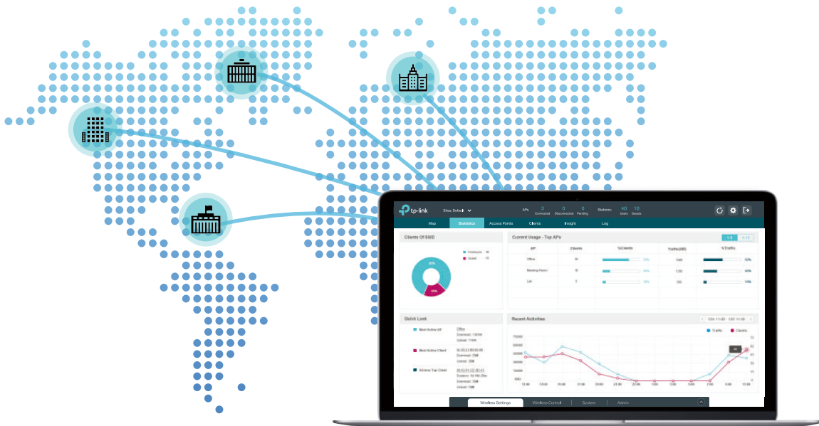
Omada Controller Software