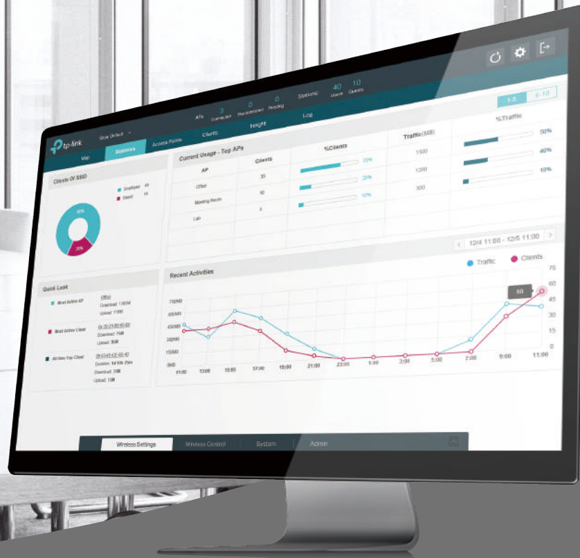
Omada Controller Software

MODELS: EAP330/EAP320/EAP245/EAP225/EAP225-Outdoor EAP115/EAP110/EAP110-Outdoor/EAP115-Wall